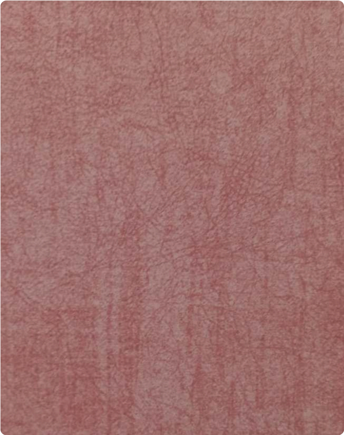
MELISA | 705