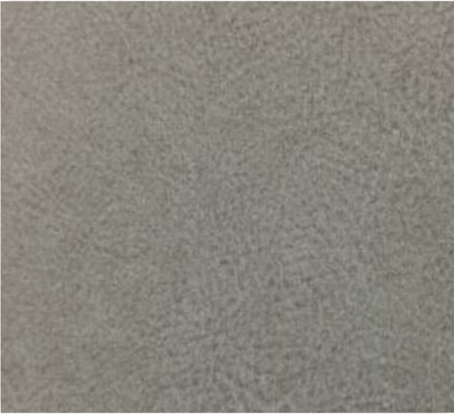
SAVANNAH | 915