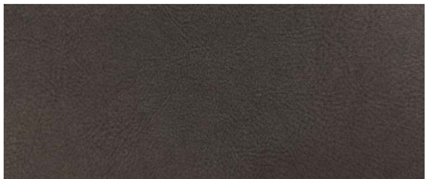
SAVANNAH | 912