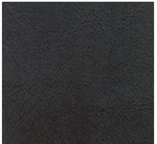
SAVANNAH | 918