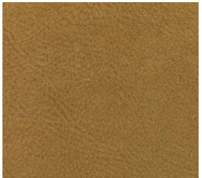
SAVANNAH | 906