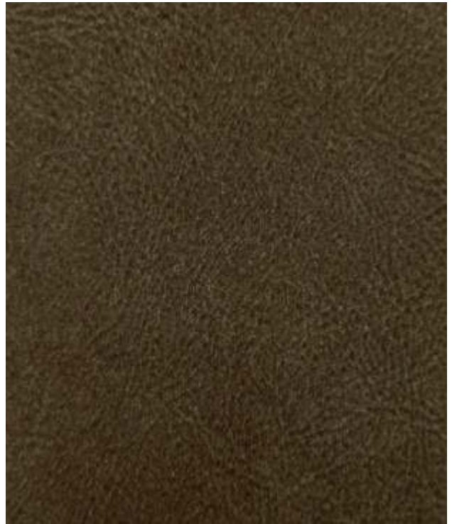
SAVANNAH | 904