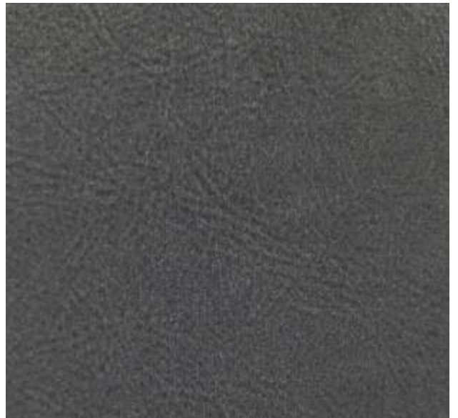
SAVANNAH | 917