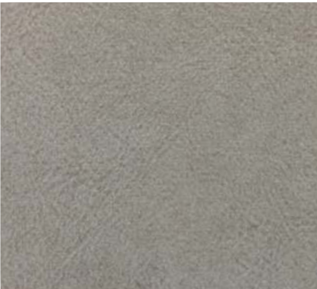
SAVANNAH | 914