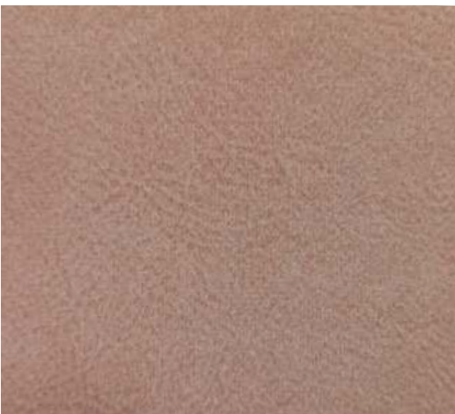
SAVANNAH | 905