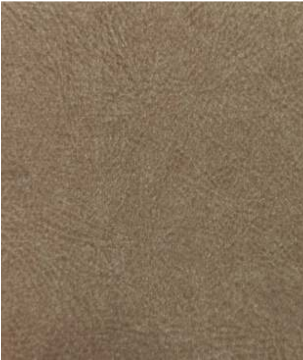
SAVANNAH | 903