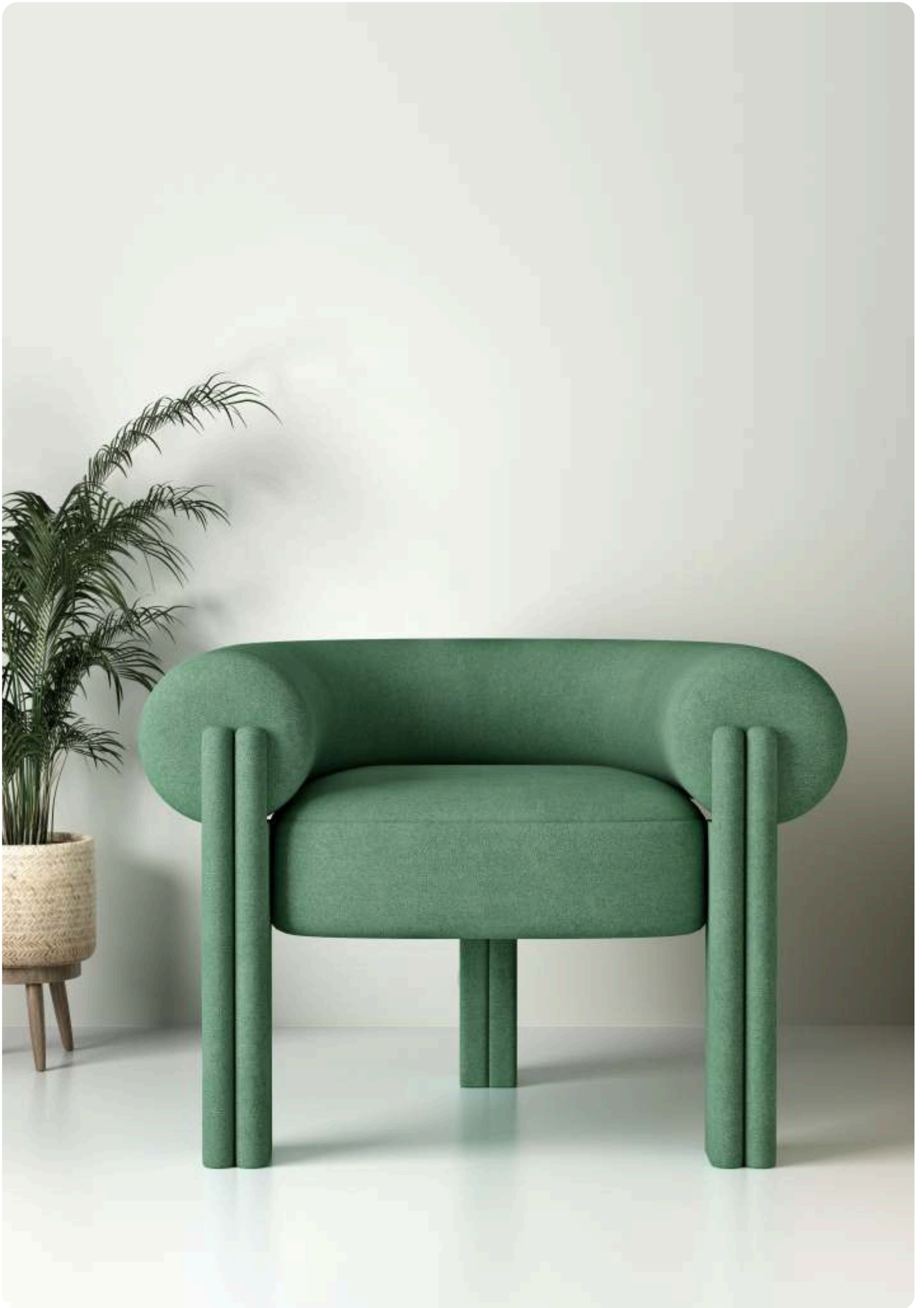
SAVANNAH American Velvet