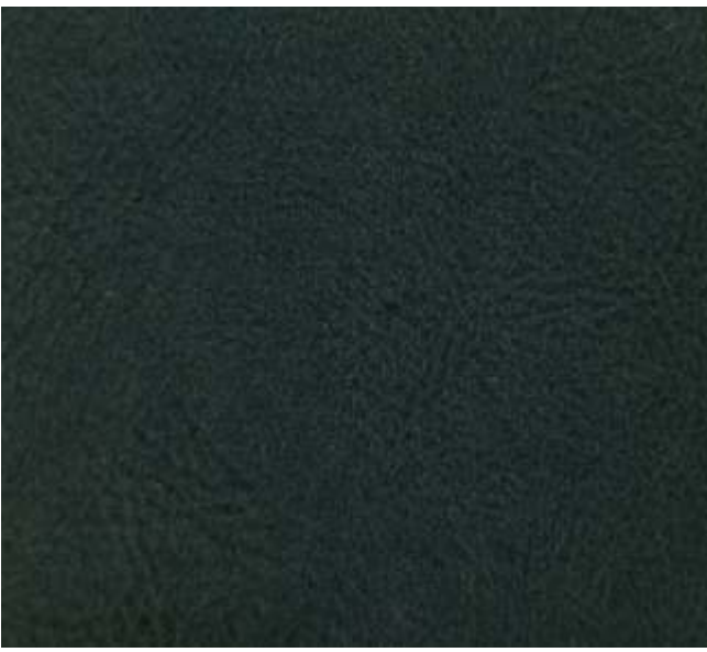
SAVANNAH | 908