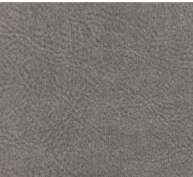
SAVANNAH | 913