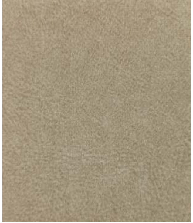
SAVANNAH | 902