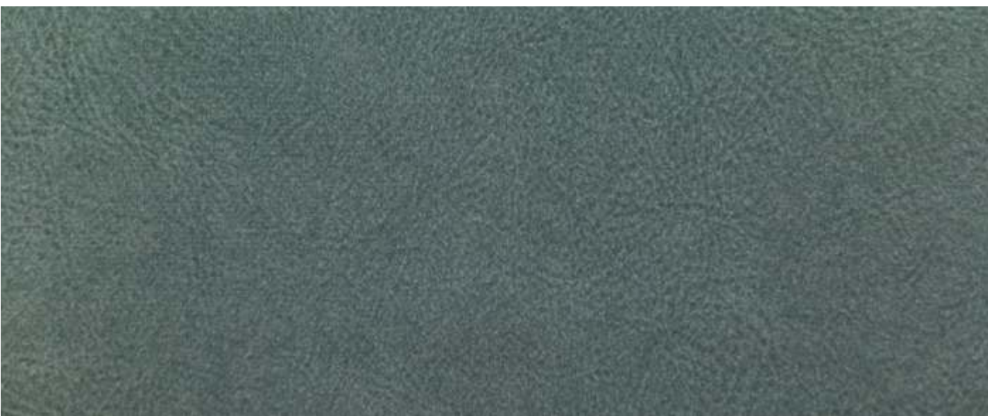
SAVANNAH | 907