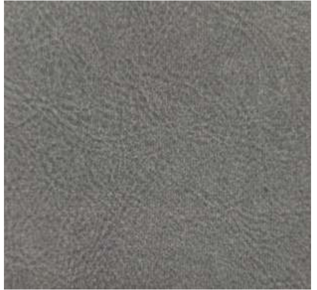
SAVANNAH | 916