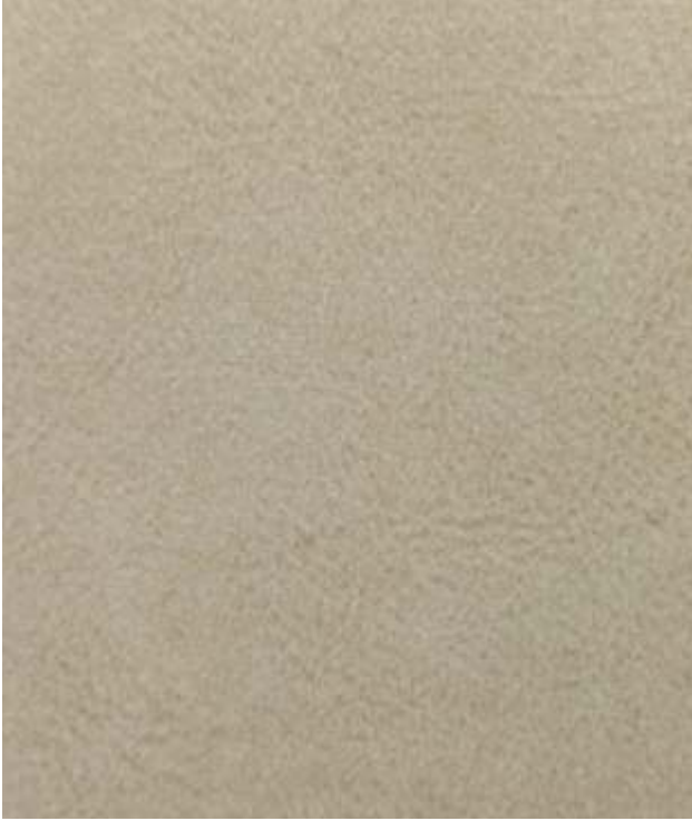
SAVANNAH | 901