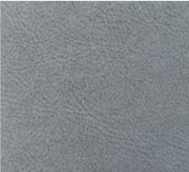
SAVANNAH | 910