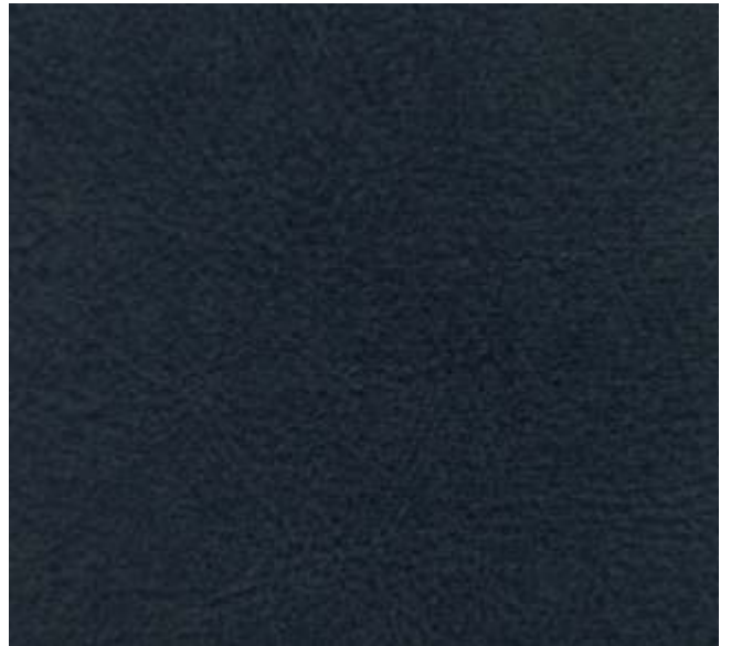
SAVANNAH | 911