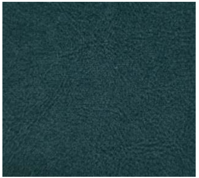
SAVANNAH | 909